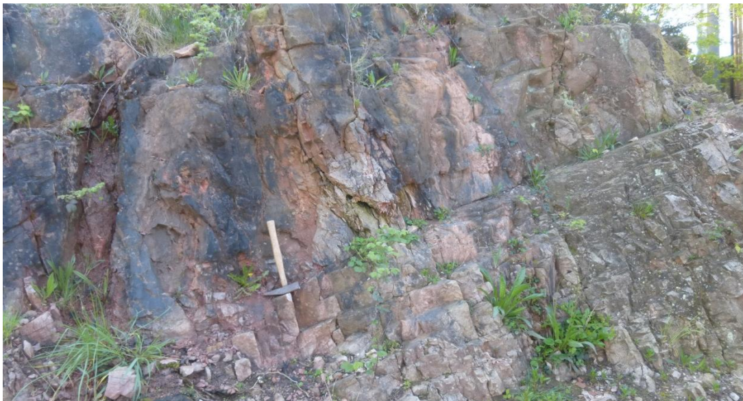
The hammer marks the UC and the neptunian dyke is seen to the left side of the picture.

A neptunian dyke is also present at this locality. Both formations are seen to be dipping in the same direction at the same angle indicating folding of these beds was later than early Silurian.