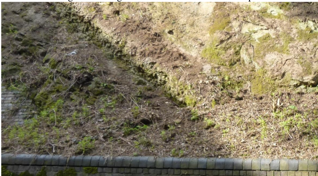
In the picture the shadow follows the line of the basal conglomerate.

During the Devonian the Iapetus ocean closed and the region became landlocked. There are no Devonian outcrops in the region so unconformably overlying the Silurian are basal conglomerates of Carboniferous or Westphalian age. These are fluvial deposits. The striking thing to note is that both the late Silurian and mid Carboniferous deposits dip in the same direction at the same angle indicating a tectonic event later than Westphalian.