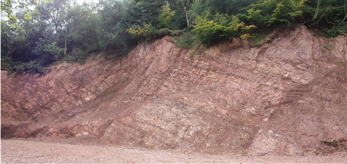
Lickey Quartzite Chevron over-folding - Barnt Green Road Quarry - (Photo courtesy of John Schroder) .

The second outcrop was at the Rubery road cutting where the eroded surface of the Lickey Quartzite is unconformably overlain by the early Silurian transgressive deposited Rubery sandstone. (Borehole data shows that silts and muds overlie the Rubery sandstone indicating a deepening environment of deposition). At the time of deposition the locality would have been approaching 30 degrees south of the equator as part of the Avalonia plate that was moving northwards narrowing the Iapetus Ocean.