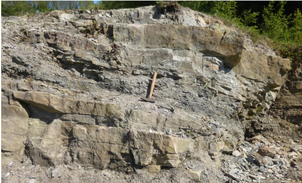
Channel sands with kaolinite rich clays

At Doulton's clay pit we got to examine fluvial cross-bedded sands, agglomerated channel sands, remnant kaolin rich seat earth and occasional thin organic-rich coaly layers. (Most of the fire clay (seat earth) and coal was extracted many years ago). The region was a low-lying deltaic swamp close to the equator with large river systems depositing thick channel sands. Deposition was thought to be cyclic although there is currently no evidence for this at this location.