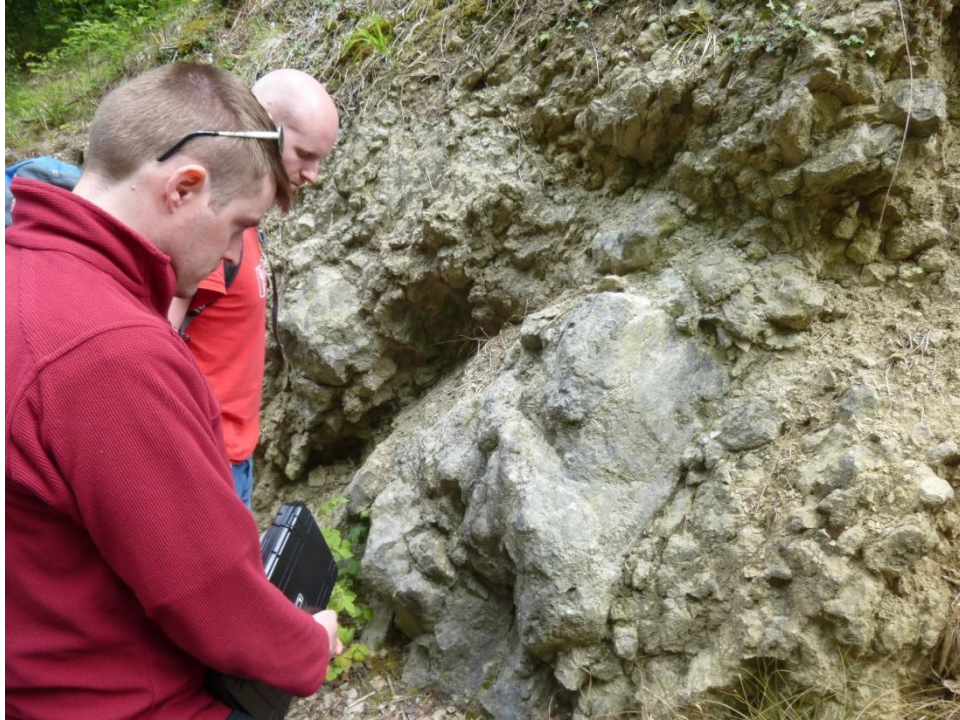
Examining a reefal assemblage within the nodular limestone beds.

We continued with our upward traverse of the stratigraphic column of the region at our next location, Saltwells Nature Reserve, where we took a look at the late Silurian, Pridoli, calcareous sandstones indicating a closer to shore environment. Fossils here were dwarfed indicating a less than ideal environment for life.