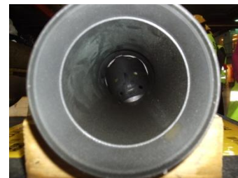
Core flapper catcher

Dependent upon location, it is possible to keep the same staff for the duration of the drilling project, thus ensuring consistency of methodology and evaluation.