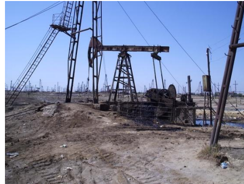
Oil field - Azerbaijan

All our wellsite consultants have 20 years plus industry experience on and offshore in a variety of play environments and are competent at;